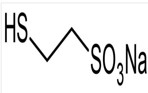
Chemical Structure - MESNA (2-Mercaptoethanesulfonate sodium), Uroprotective agent (ab142616)

2D chemical structure image of ab142616, MESNA (2-Mercaptoethanesulfonate sodium), Uroprotective agent